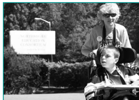
Friends and family walking and rolling on June 4th.